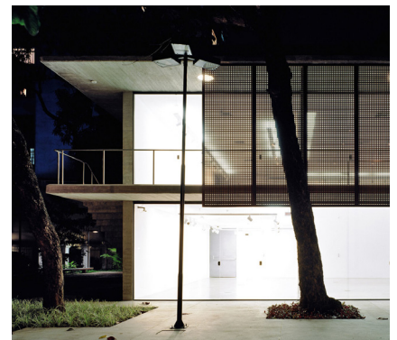
Rodin Bahia Museum, Salvador, Brasil (2002)